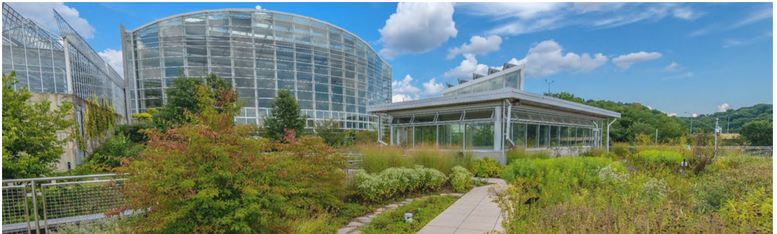
Plants growing naturally along the sidewalk, some leaning in.

The specific construction requirements of mandated and incentivized green roofs also vary, from simple roof coverage and media depth requirements, to more complex construction standards which include items such as leak detection and minimum maintenance standards. Over the past five years, Green Roofs for Healthy Cities and the Green Infrastructure Foundation have worked to develop a comprehensive performance rating system for green roofs and walls called the Living Architecture Performance Tool (LAPT). The LAPT is intended as a readily implementable standard for municipalities to assert a consistent set of design, construction, maintenance, and performance requirements. A number of different projects, from simple sedum roofs to more complex intensive roof gardens have been certified under the LAPT. In some jurisdictions, where such policies and regulations have been considered, initial costs for a green roof have – unsurprisingly – proven to be a political challenge as development constituencies have reacted to first costs rather than considering life cycle costs. However, in a variety of markets, geographies, and bioclimates, the life cycle value and financial return of green roofs has been demonstrated to be consistently robust, resulting directly in the increasing number of cities establishing mandatory requirements typically focused on new buildings.