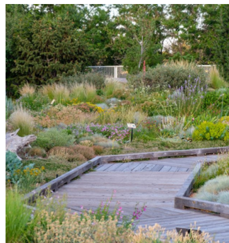
Mordecai Children's Garden green roof.

For many building owners and developers, the common private benefits may not be perceived as sufficiently quantified or immediate enough to justify the additional upfront capital investment. This is where financial and regulatory incentives become important. Examples include the City of Toronto's Eco-Roof Incentive Program which offers CDN$100 per square meter of green roof and Washington DC's US$15 per square foot incentive in targeted watersheds where combined sewer overflows are frequent.