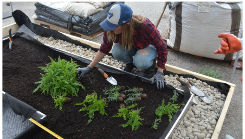
Green Roof Installation and Maintenance Professional (GRIMP) training in progress.

The following document summarizes green roofs and wall policies across Canada and the United States that encourage widespread adoption. The policies are separated into two categories - mandatory requirements and incentive programs. There is also a section that lists other policies that promote green infrastructure for stormwater management. These case studies can be used in conjunction with Green Roofs for Healthy Cities' other resources to create well-developed and effective policy.