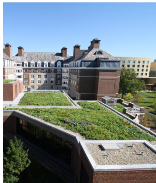
LAPT Silver: Harvard Business School's McArthur McCollum Building.

Municipalities do not need to invent such a framework (unless they really want to): The Living Architecture Performance Tool is available to calibrate the performance of green roofs and walls. It provides a scientifically based framework of performance measures and minimum prerequisites for the design, installation, and maintenance of these technologies.