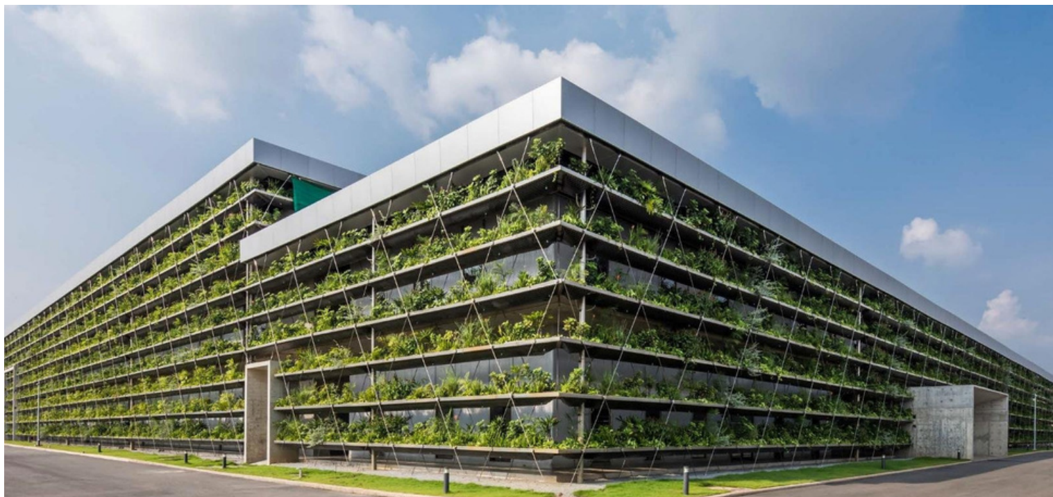
Multi-story green facades around an inner courtyard, Jakob Rope Systems, Vietnam.

It is recommended to seek feedback from other municipalities who have generated policies and regulations, as well as attempt to achieve early support from stakeholders. In 2017, Denver passed the Green Roof Ordinance after a citizen-led effort advocated for green roof policy. The ordinance mandated green roofs on both new and existing buildings. The requirements for green roofs on all existing buildings were particularly concerning to some constituencies, and led to well-organized and funded opposition to the initiative. Following passage, a technical committee was convened to adjust the requirements mandated by the sweeping initiative. Over the course of that process, it was determined that green roofs are not a feasible option for 95 percent of existing buildings because they would be unable to support the extra loading requirements. This opened the initiative language to a fundamental reworking, and it was ultimately amended to now mandate that buildings have a cool roof and one of a series of compliance options, of which installing green roofs or walls are included. The complicated array of options in Denver comes with an immediate cost: staffing to administer the ordinance is multiples greater than other cities with clear codified mandates. This added cost also makes the program vulnerable to future budget processes in leaner times.