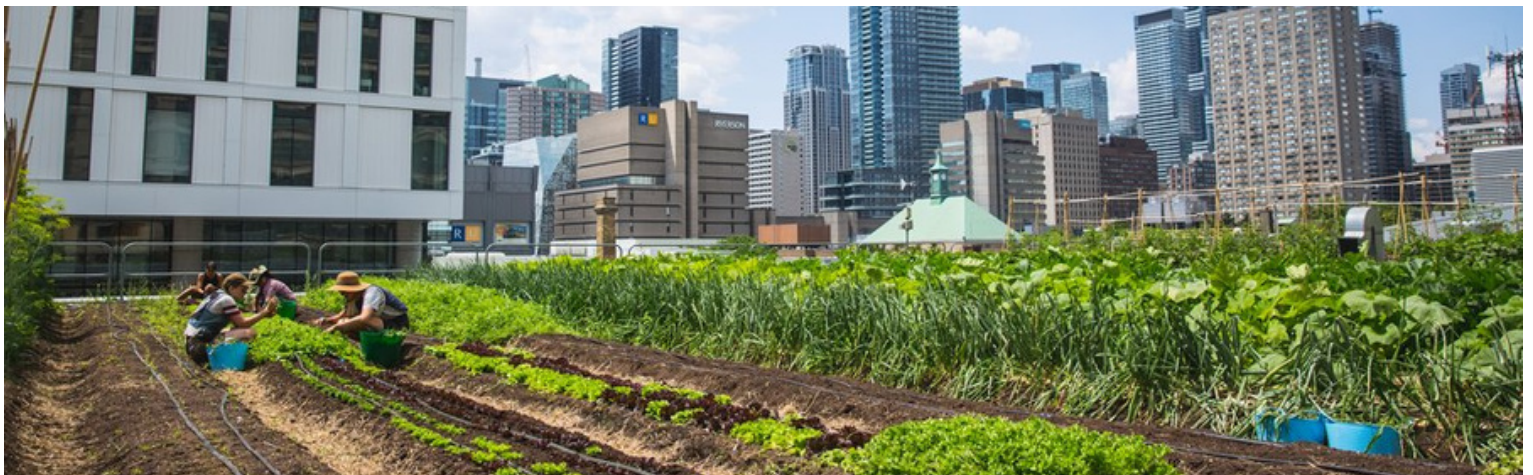
The Urban Rooftop Farm on the Toronto Metropolitan University (TMU).

Given the variety of buildings, both new and old, that exist, it is important to recognize that policy may need to be fine tuned to meet the specific needs of different market segments. Financial analysis of the costs and benefits of different policies for new and existing buildings, will help policy makers avoid potential conflict with building owners. Existing buildings are rarely 'required' to install a green roof or wall after the fact, but rather, are provided with incentives to do so.