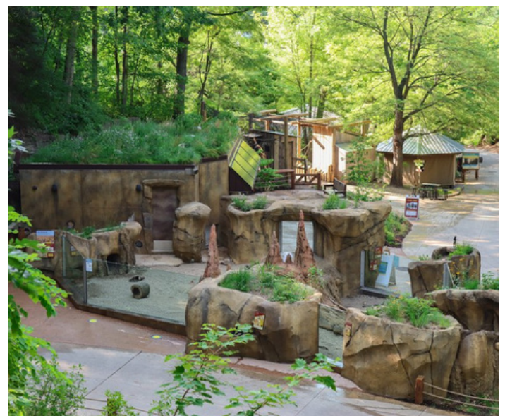
LAPT Platinum Certified green roof at the John Ball Zoo in Michigan

The likely arguments against green roofs are generally predictable and typically centered around cost and technical issues. Stakeholders should be identified at the beginning and early outreach should anticipate such concerns, and be prepared to address them as they arise, regardless of the form of public process.