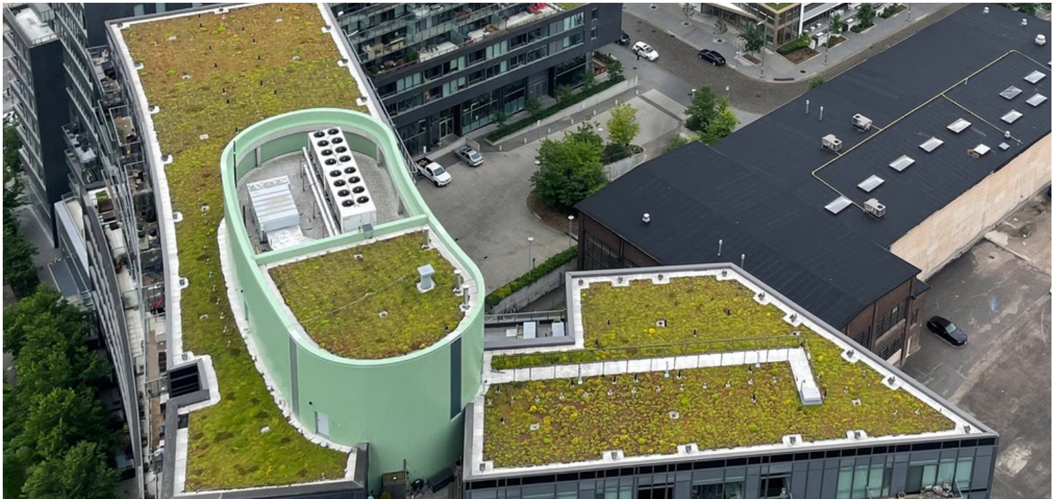
River City 3 Condominiums, Toronto.

Ultimately, success in increasing green roof policy and the widespread implementation of green roofs is a direct result of green roof champions in government and industry collaborating to promote and sponsor legislation. In partnership with third parties, such as Green Roofs for Healthy Cities, and passionate citizens advocating for change, green roofs will continue to be assertively advocated for and implemented as an essential and effective means to combat local and global environmental challenges.