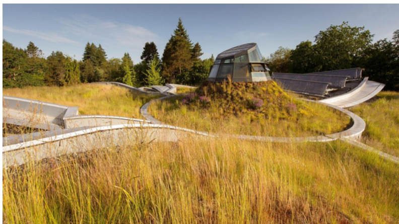
Van Dusen Botanical Garden Visitor Centre 2017 by Connect Landscape Architecture Inc. with Architek.

These green roof types retain and detain stormwater within an enhanced green roof section by augmenting the growing media with synthetic materials that act like sponges in the green roof. Unlike Blue Roofs, stormwater in a Blue/Green Roof is held in the pore spaces in the growing media and synthetic elements and released via transpiration and evaporation from the plants within the Blue/Green green roof assembly.