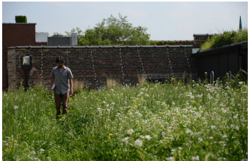
Carroll Rooftop Farm, Chicago, IL.

In this age of significant public resource constraints, and growing challenges, green roofs and walls provide proven approaches to meeting multiple policy objectives at minimal cost, and can contribute over time, to helping make our communities more resilient.