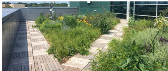
East Building Addition, Adlai E. Stevenson High School, Lincolnshire, IL.