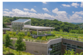
Summer 2023, Case Study, Phipps Conservatory and Blaine Stand