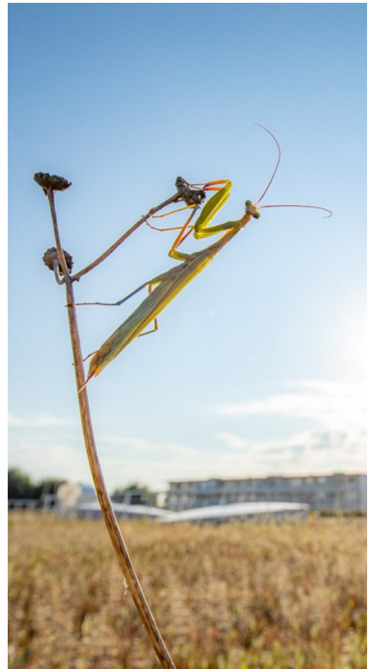
Praying Mantis on Basel's biggest green roof on Stüchi Shopping mall.

Plants and soils/engineered growing media, sequester carbon and produce oxygen. Green roofs can play an outsized role in a communities' climate action, mitigation and adaptation plans when deployed in the aggregate. Green roof mandates begin to address the need to achieve wholesale deployment of this important tool. The more types of vegetation and deeper growing media deployed, the greater the carbon sequestration impact.