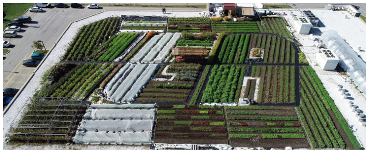
IGA rooftop farm, Quebec, Canada.