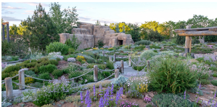
The mixed intensive-extensive green roof at Denver Botanic Gardens.

Increase in property values with a corresponding return in property taxes to the city