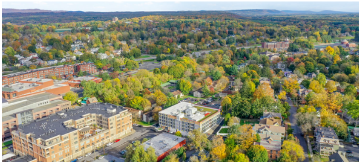
Moderne, Saratoga Springs, NY.

Green roofs have the ability to retain stormwater through the plants, growing medium and additional layers that capture and hold, or slow the progress of water off a roof. Many jurisdictions recognize green roof assemblies for their stormwater retention benefits through stormwater regulations. In recent years, manufacturers have begun introducing green roof systems that enhance the stormwater retention capacity of green roofs, often through the use of cups in the drainage layer, fabrics or fleeces that expand to hold more water. They are also incorporating systems that allow for the detention of stormwater (typically up to 6 inches in depth) for a period of time, often two to three days, before controlled release. The detention capacity gives civil engineers a greater degree of certainty over stormwater management than retention alone. Managing stormwater on roofs, can save developers costs associated with below grade or under-building stormwater detention structures and the space and mechanisms they require.