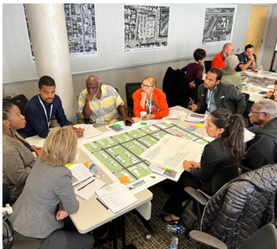
A Charrette program.

The Green Infrastructure Foundation (GIF) is the charitable arm of Green Roofs for Healthy Cities. It has an independent board of directors. It supports policy development through community engagement, training and research.