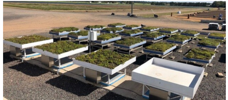
Stormwater retention testing.