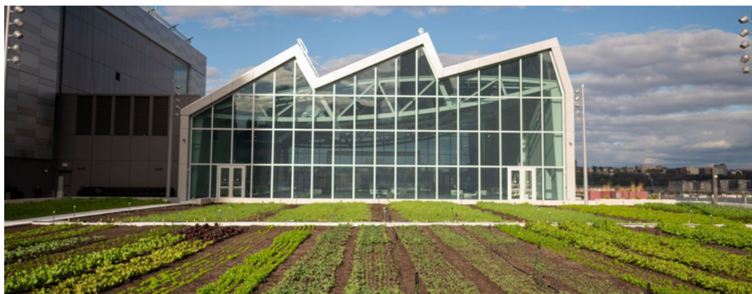
The Javits Center, New York City. The waterproofing is done by American Hydrotech, and the urban agriculture assembly is managed by Brooklyn Grange.

Growing food on rooftops is an increasingly widespread application where urban farmers grow food crops on specially designed green roofs. A wide variety of crops, from vegetables to vineyards, can be cultivated on rooftops.