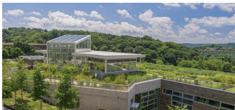
An intensive green roof at the Phipps Center for Sustainable Landscapes 2020.

As the growing media thickness gets deeper (8 - 48 inches), intensive green roofs successfully support a very wide array of plant species and sizes including full size trees. Very often intensive green roofs are combined with other features such as pedestrian and amenity features to increase the usability of these rooftop environments.