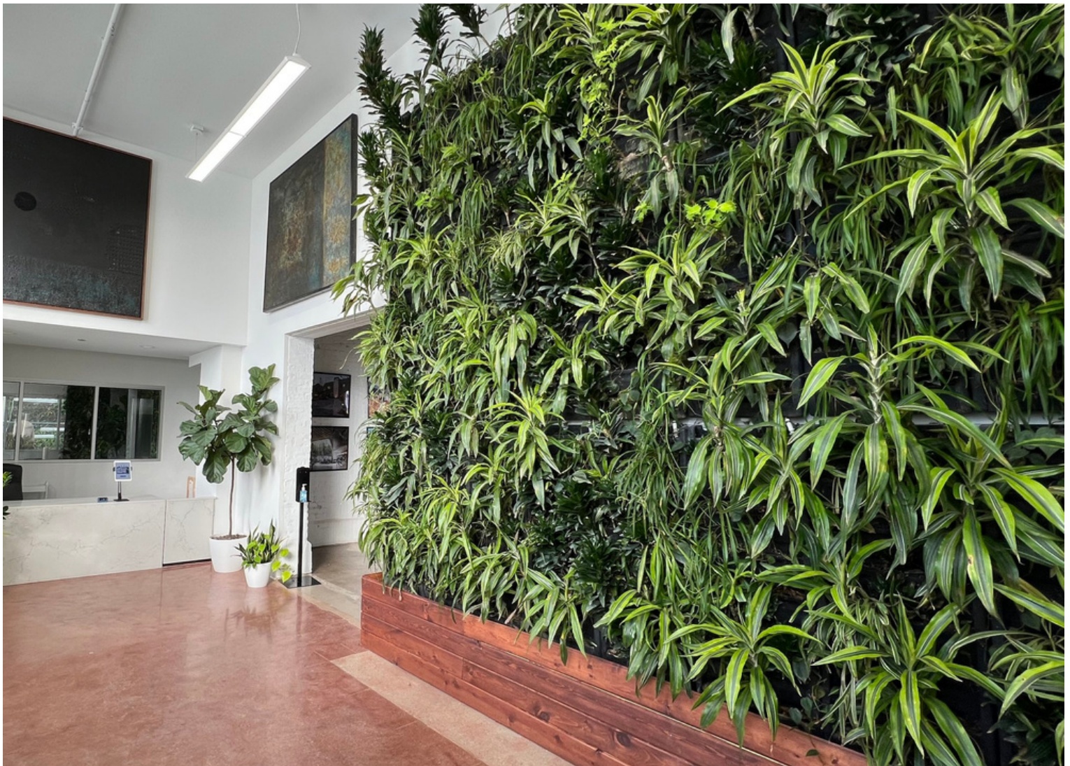
The lobby of Hatch 41, Chicago, IL.