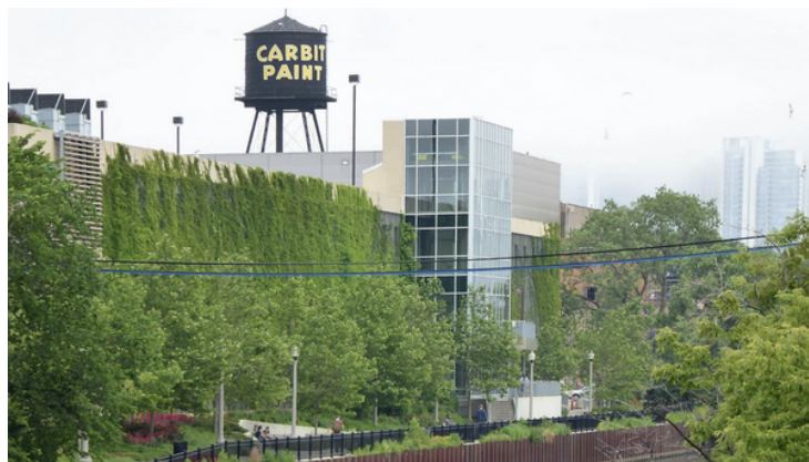
The Shoppes at Kingsbury Square, 2014

Facades are a structured system of stainless steel cables or grids that support climbing plants growing in planters from a planter bed, supported by a wall or other structure element or directly in the ground.