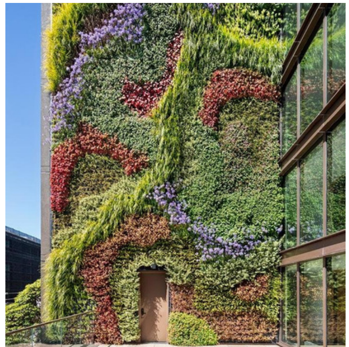
Photo: Habitat Horticulture Exterior Living Wall at 2177 3rd St. in San Francisco, CA.