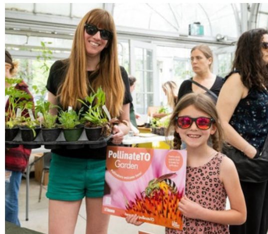
PollinateTO grant recipients, Toronto.

Incentives have played a big role over the last decade in many cities, particularly when the benefits of green roofs were unproven and/or unknown. Incentives make sense now, only if it is the only politically viable path.