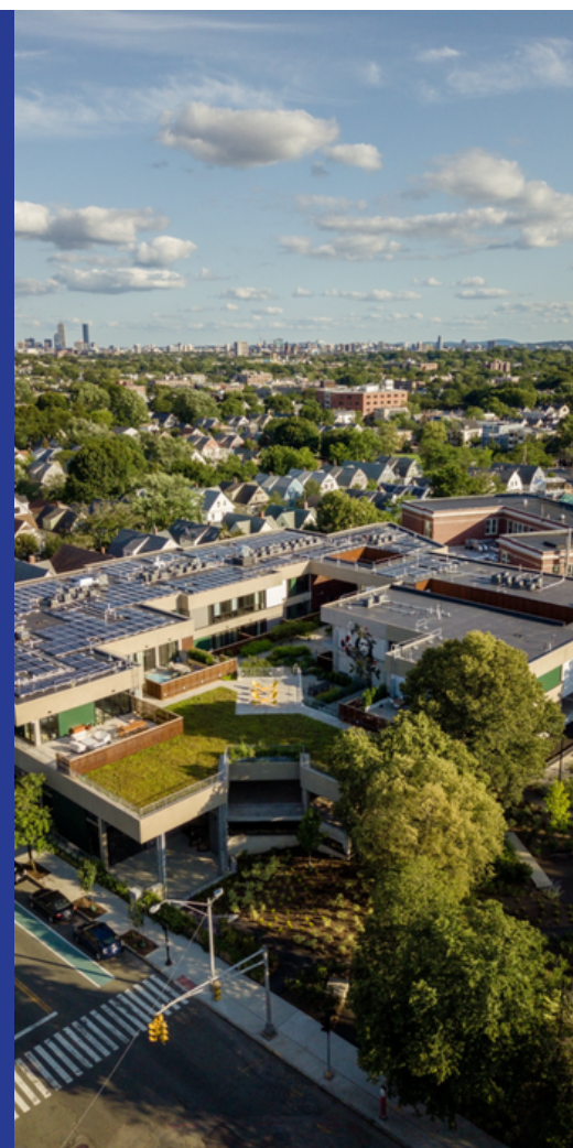
Powderhouse, Somerville, MA.