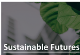
Summer 2023, Podcast