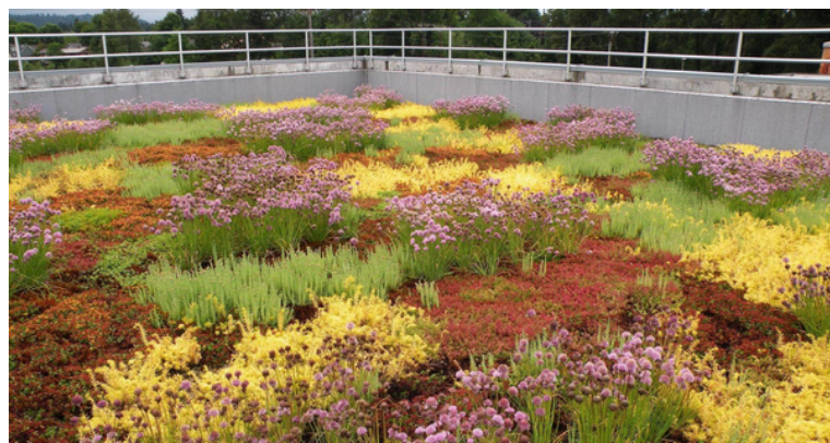
The extensive green roof at the Tri-City Water Resources Recovery Facility - Oregon.

Typically the thinnest assembly (2 - 6 inches of growing medium), these green roofs are some of the most common green roofs constructed today. In certain areas of the USA, these extensive green roof systems are used for significant stormwater Best Management Practices (BMP) facilities. Variants in components can greatly increase the water holding capacities of these extensive assemblies.